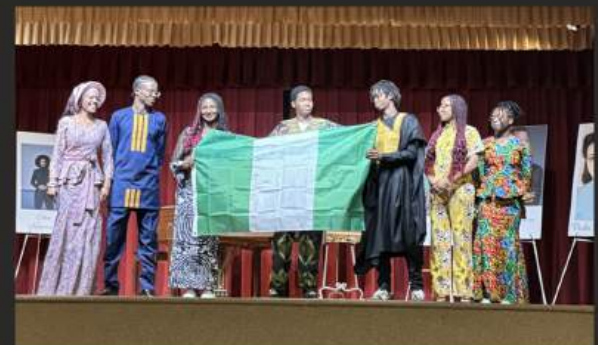
Field trip to LiUna to learn all about trades and related opportunities in our region. Fieldtrip to Canadian Aviation Museum. Students facilitated our first ever Black History Celebration.