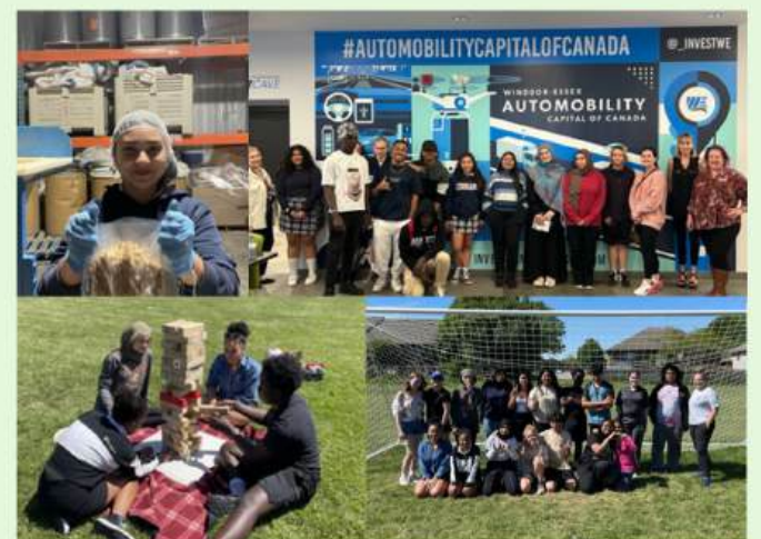
Grade 10 student from Cardinal Carter High School, volunteering at Gleaners. Career Exploration field trip to the VR Reality Cave with Invest WindsorEssex. Outdoor games for some Leamington fun