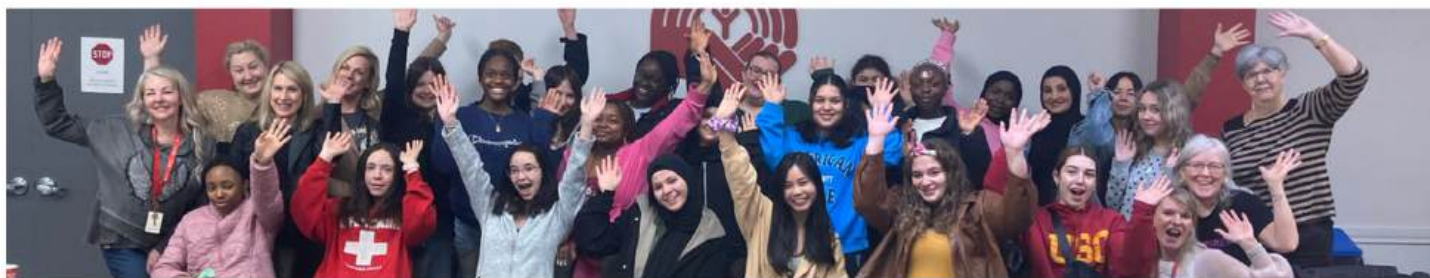
Breakfast at the United Way office before prom dress shopping

Women United members are a powerful network of changemakers, who have a positive influence on each other's lives as well as building the capacity of the On Track students. A highlight for OTTS's grade 12 students and WU members is the annual Say Yes to the Dress event hosted by New Beginnings. Students and mentors spend a wonderful morning choosing dresses and ensuring students feel confident and comfortable ahead of their prom night celebration!