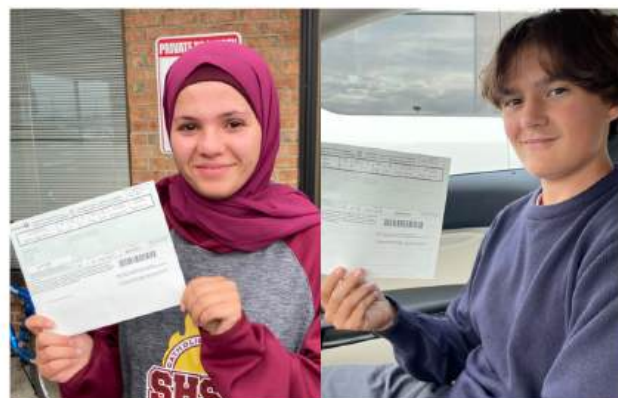
Some of Windsor's newest G1 license holders with support from Women United

In Windsor - Essex, this committed group of women are focused on reducing poverty, supporting kids and families, and strengthening neighborhoods. What began with 20 members in 2014 and has grown to become a diverse coalition of 60 women donors united by their shared desire to create lasting change.