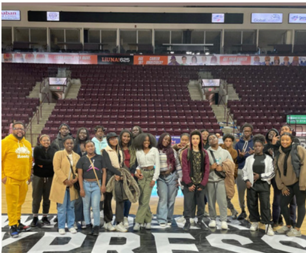
Windsor Express Basketball Game

The Ujima Initiative had its busiest year to date with so much accomplished and even more to look forward to. The Ujima Initiative is an equity strategy of the OTTS program which aims to provide culturally relevant support and mentors to black youth. Some of this year's highlights included inviting local black professionals to discuss their educational paths and career journeys. We also welcomed local artists to provide storytelling experiences through music and art. However, nothing beat the fun and friendships that the Ujima Initiative fostered by getting our youth out in the community.