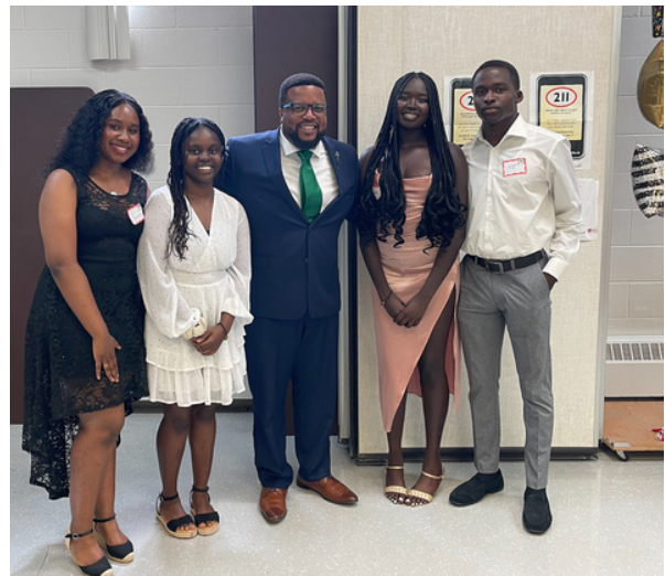
Black Futures Graduation Celebration