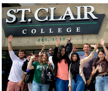
Grade 12 students attending personalized tours of St. Clair College and the University of Windsor.