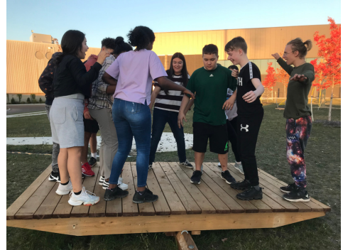
Low Ropes Course at the Toldo Lancer Centre

While we are proud of the academic and career assistance we provide for our youth, sometimes students need to have some fun just for the sake of it. Our OTTS fieldtrips allow our youth the opportunity to connect with their peers and create bonds that we hope will transcend their time in high school and in our program.