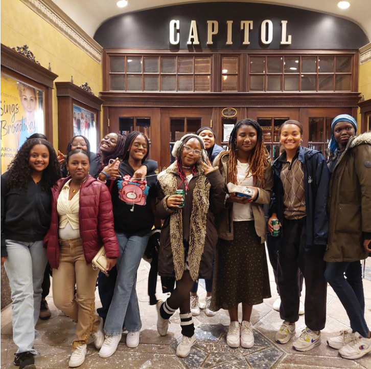
"How Did We Get Here" by Black Kids in Action at the Capital Theatre