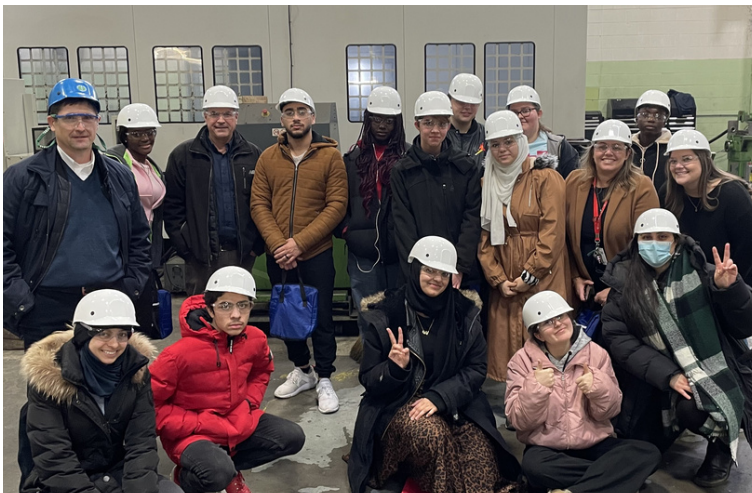
Tour of Kapco Tool & Die

We are extremely proud of our Career Exploration program for Grade 10 and 11 students. This program allows students to tour different workplaces throughout Windsor-Essex to learn about local, in-demand career options in our community. We also invite guest speakers to participate in our Sector Spotlight Series where students meet local professionals to learn about their place of business and the educational pathways they took to get there.