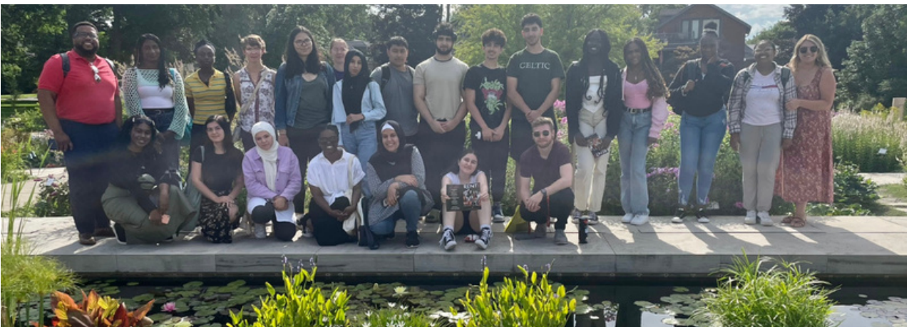
Stratford Festival Field Trip to see the rock musical, "Rent" by Jonathan Larson

While we are proud of the academic and career assistance we provide for our youth, sometimes students need to have some fun just for the sake of it. Our OTTS fieldtrips allow our youth the opportunity to connect with their peers and create bonds that we hope will transcend their time in high school and in our program.