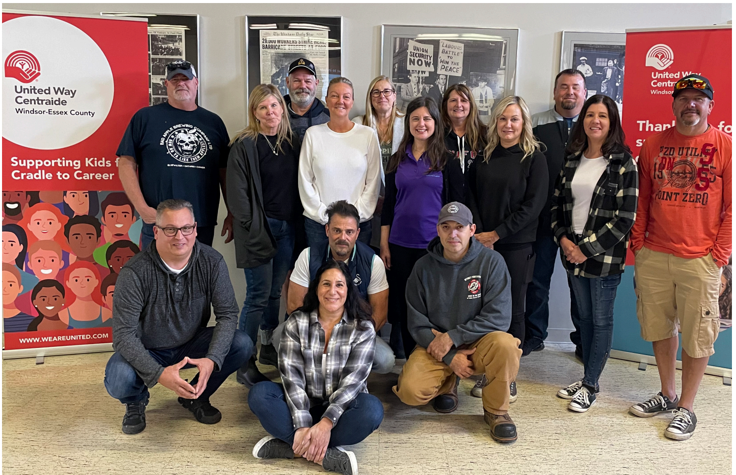
Ford, Unifor Local 200 & 240 United Way Champions (2022)

With our partners, we're delivering solutions that will support food and nutrition, mental health and out-of-school supports for local children and their families. This includes programs like Ignite Academy to improve math and literacy skills for children in Grade 2 through Grade 7, On Track to Success to improve high school graduation rates, and Summer Eats for Kids.