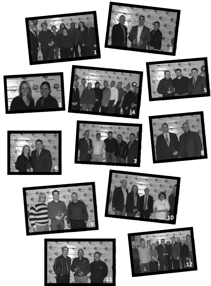
2009 I Believe in My Community Awards Recipients

For complete details, visit www.weareunited.com/campaign