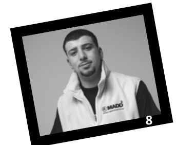
2009 Volunteers Changing Lives Awards Recipients