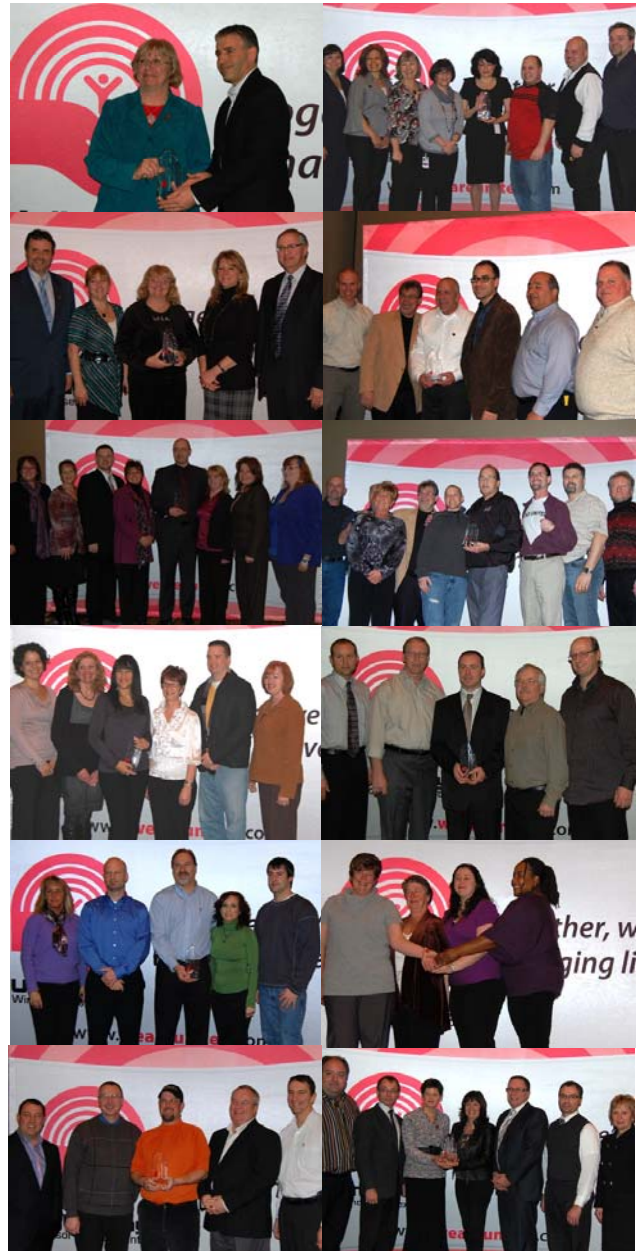
Recipients of the 2010 I Believe in My Community Awards

Hiram Walker & Sons Ltd.– A Pernod Ricard Company CAW Local 2027 & IUOE Local 772 Sponsored by: Deloitte & Touche LLP