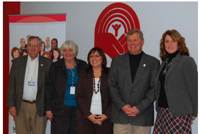
Representatives from Canadian Mental Health Association, Citizen Advocacy, Family Service Windsor-Essex, Hospice of Windsor-Essex and United Way gather at a press conference to launch the Counselling Alliance in 2010.

With the support of United Way for this new collaboration, these agencies have eliminated the wait time for counselling services. Counsellors are available for scheduled 1:1 appointments in Windsor, Tecumseh, Lakeshore, Essex, Leamington and Amherstburg. As part of the collaboration, Family Service Windsor-Essex County implemented an innovative and new model which is the walk-in clinic. Group programs have also been designed to meet psycho-social and educational needs. Intake is available in several languages through interpretation services of The Language Line and counselling can be delivered in seven languages. Another success of this strategy is the new partnerships that have been formed beyond the original collaboration.